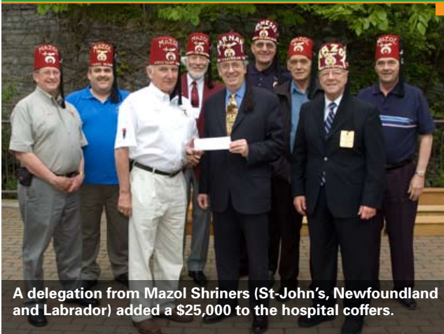
A delegation from Mazol Shriners (St-John's, Newfoundland and Labrador) added a $25,000 to the hospital coffers.